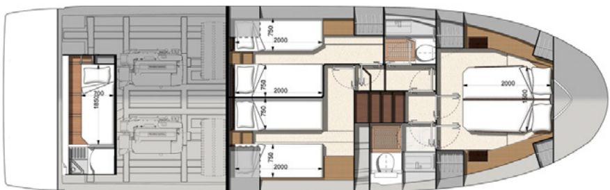
Model available with 3 cabins